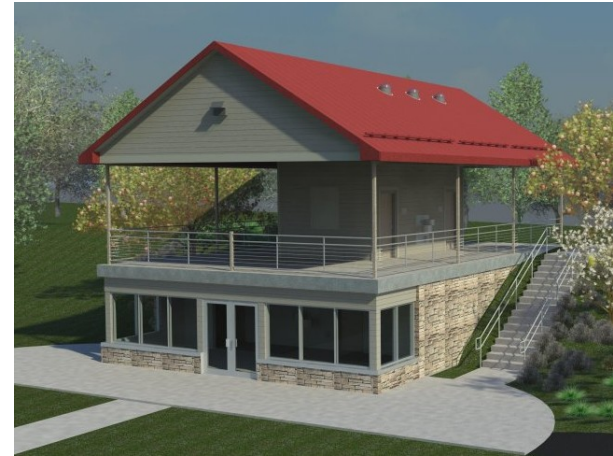
Proposed Comfort Station with lower level indoor pavilion